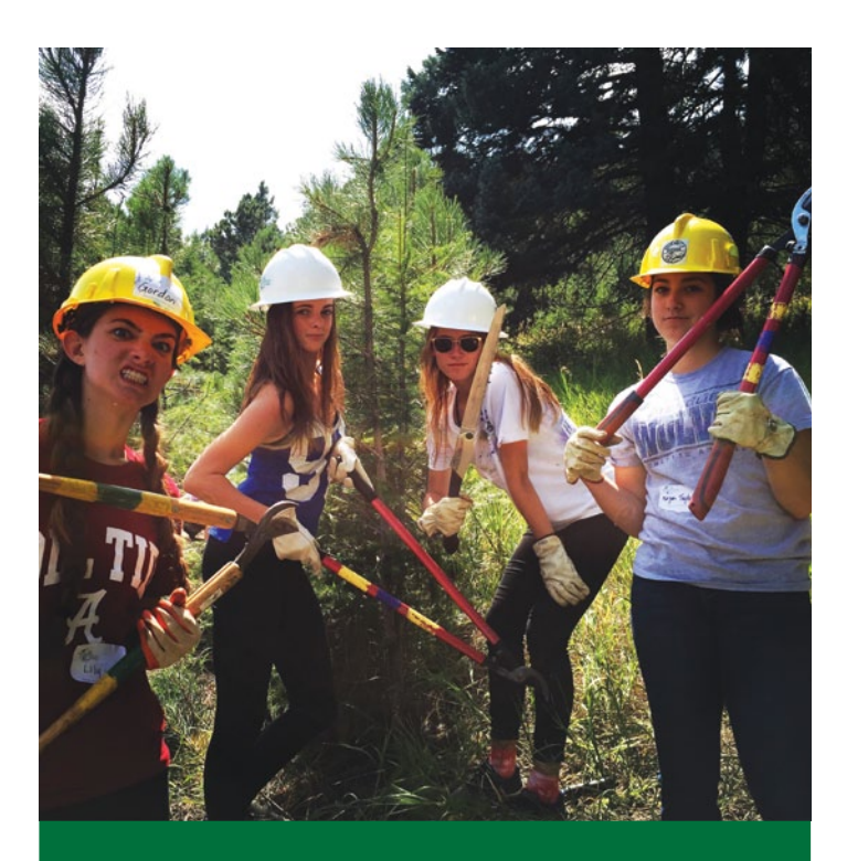
WRV's growing youth programs are introducing more and more young men and women to the importance of stewardship for our public lands.

They all go to different schools in Boulder County and have different reasons for caring about WRV and stewardship, but if you stop by WRV's Boulder office on a Friday afternoon, you might find the