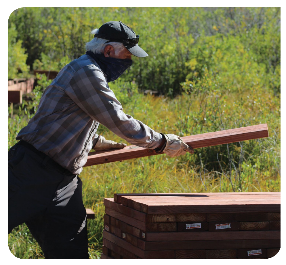
Your support helped purchase materials for restoration. Here, a volunteer uses a pallet of wood to deck a boardwalk. This boardwalk will protect a high-elevation wetland from trampling. 2020.