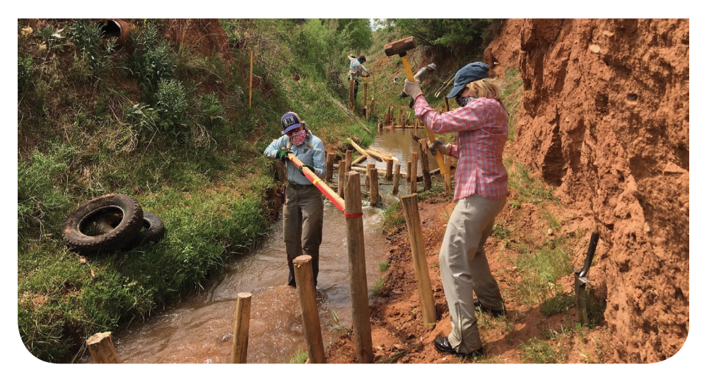
Your financial contribution is a support for the over-80% of Colorado native wildlife that depends on stream-side habitat for some or all their life cycle. Here, volunteers use long-handled tools to safely build structures. These innovative, induced-meander structures heal incised streambanks and rebuild stream-side habitat.

Although we couldn't have campfires or share communal meals, and our numbers had to be kept low, the desire for community that sustains WRV shone through. You supported us to unite for good in a year full of uncertainty and isolation. Thank you!