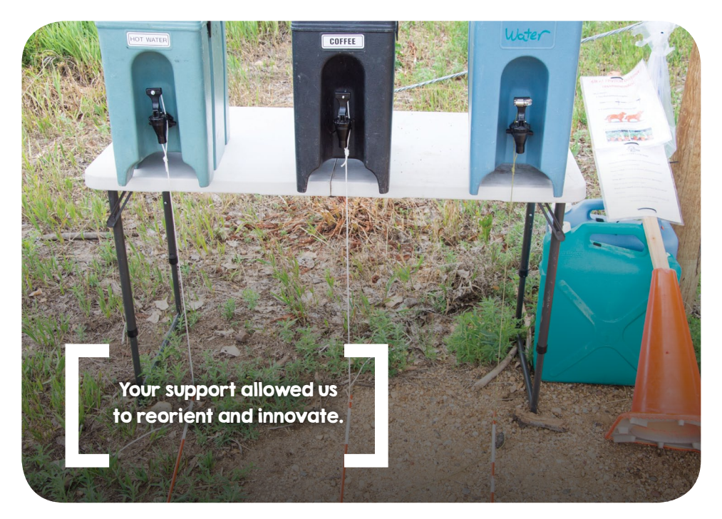
The most crucial WRV COVID-19 adaptation, at least to some volunteers – touchless coffee stations! WRV photo, 2020

handwashing equipment, and revised plans led to over 140 projects in a year when we thought we might not have any at all.