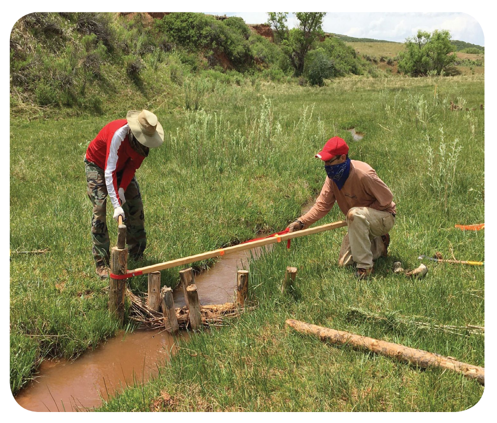
Your support paid for newly improvised long-handled tools to allow volunteers safe physical distance. Here, volunteers use these tools to install a water-slowing structure in the stream.

Your support allowed us to reorient and innovate. New safety protocols, new